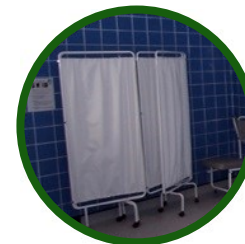
18. Privacy Screen / Curtain