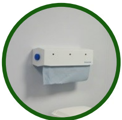
8. Large Paper Roll Dispenser