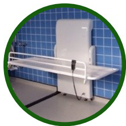
1. 1800mm Height Adjustable Changing Table