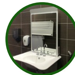
4. Wash Basin (Preferably Height Adjustable)