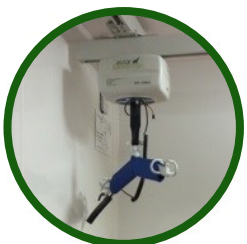
2. XY Ceiling Track Hoist (H Frame)