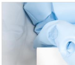
Strong suckers and twin skin vinyl material

We provide a warranty document and user guide with every cushion we deliver, detailing comprehensive instructions to follow in order to maintain the cushion lifespan.