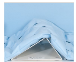
Holes in the cushion help water circulation (shown with optional knee block)