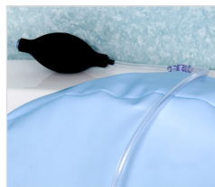
Small handheld pump and valve to extract air