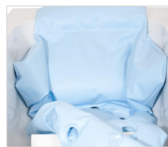
Integrated side 'wings' for added comfort