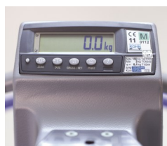
Optional digital weight scale