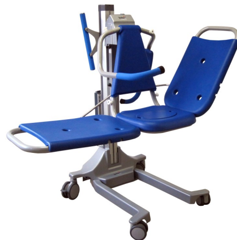
Shown with optional side wings

With a range of options such as side stretcher wings, side rails and integrated calibrated patient scale, the Senta mobile hoist is able to fulfil a range of patient handling and manual handling tasks.