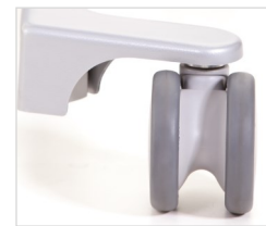
4 Double casters (2 lockable)