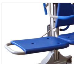
Side wings to convert seat to stretcher