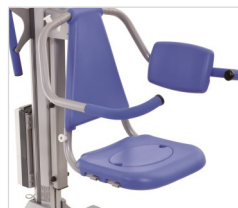
Commode seat, headrest and comfort grip handles