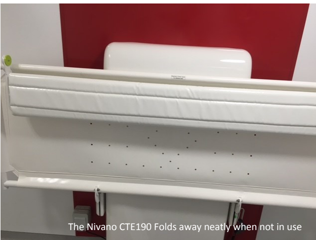
The Nivano CTE190 Folds away neatly when not in use

For over 20 years' Astor-Bannerman has built an exceptional reputation within the Social Services and Local Authority Sectors where it is held in the highest regard.