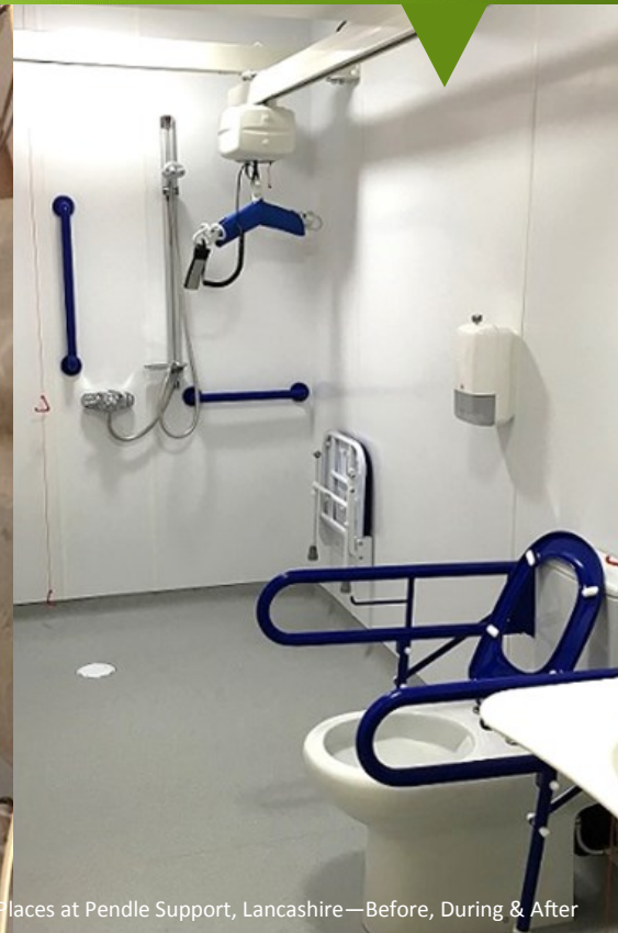
Changing Places at Pendle Support, Lancashire—Before, During & After

Pendle Support & Care Services in Lancashire provide support to children and adults with learning disabilities, physical disabilities and mental health issues.