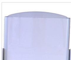
Integrated colour changing LED strip lighting