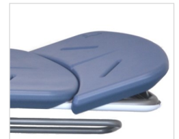
With 1 or 2 tilting headrests