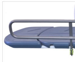
Optional front and side guards