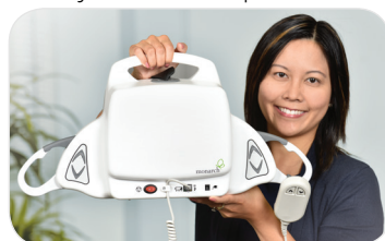
Easy Transport Handle