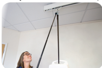
Available with telescopic reacher