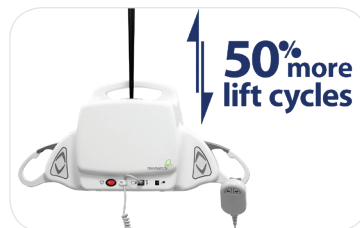
50% more lift cycles