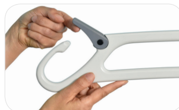
Unique Secure Sling Mechanism

Product Specifications Monarch Portable Hoist