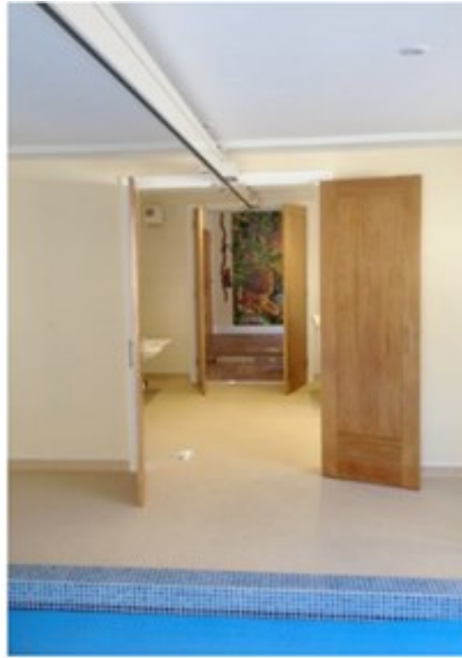
View through inter-connecting rooms