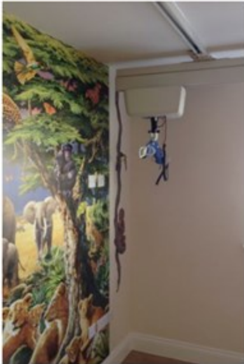
Ceiling Hoist in Child's Bedroom